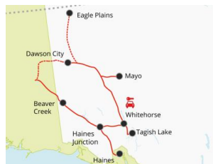
Splendid Nature of the Yukon 15 days / 14 nights Page 27