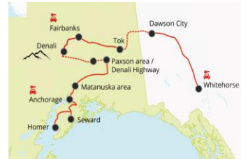
Most Scenic Roads 16 days / 15 nights Page 24