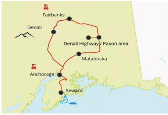
Classic Alaska 8 days / 7 nights Page 11