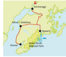
Explore Kenai Peninsula 8 days / 7 nights Page 16