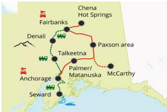
Discover Alaska by Train & Car 15 days / 14 nights Page 18