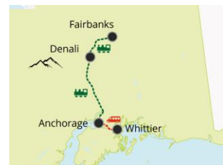
Whittier to Fairbanks by train 6 days / 5 nights Page 30