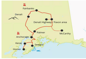
Great Alaska 15 days / 14 nights Page 13