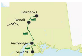
Seward to Fairbanks by Train 7 days / 6 nights Page 29